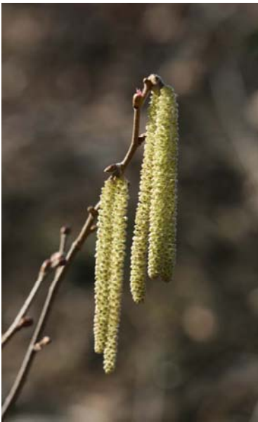
The male flowers or catkins

One of the earliest northern shrubs to flower is the American Hazelnut or Filbert ( Corylus americana ). The American Hazelnut is a monoecious plant, meaning that it has distinct male and female flowers on the same plant. The long pendulous male flowers are hanging off several branches; and the smaller, less obvious, violet colored female flowers are positioned at the terminal ends of the branches. This shrub is an amazing plant with a versatile fruit similar to the European Hazelnut ( Corylus avellana ), which is the primary ingredient in Nutella™. American hazelnuts are hardy from zones 4 to 9 and are an under-story shrub/small tree which can reach heights greater than 10'. These plants made their home here at TBG's Useful Shrub Collection last year in the northern section of the Pioneer Garden as part of a donation from Summer Shades Nursery in Swanton, OH. Continue to check on them throughout the season, and with a little luck they will produce an edible nut by October.